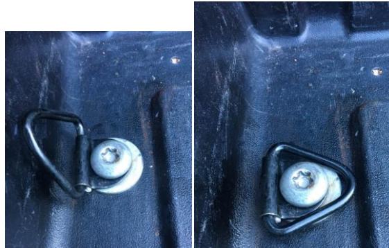
Figure 5 Mounted Front Left