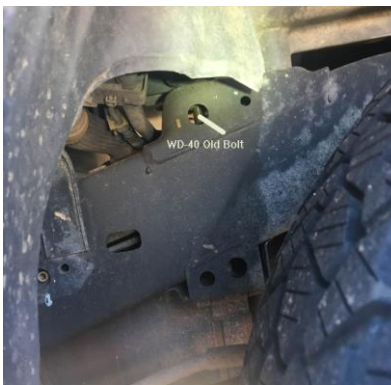
Figure 6 Left Front Bolt Lube Location