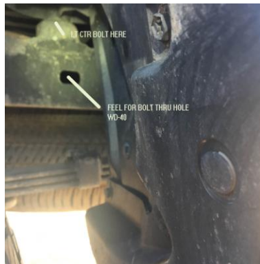
Figure 7 Left Center Bolt Lube Location