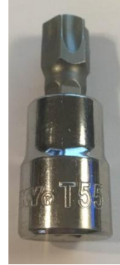
Figure 3 3/8" T55 TORX