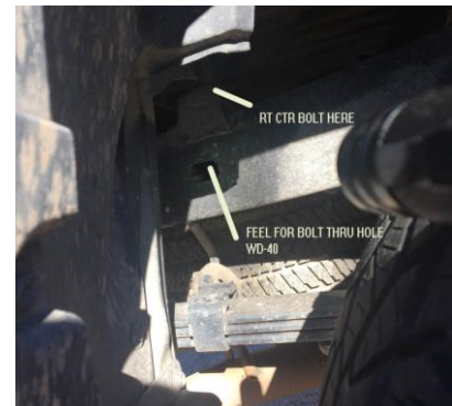
Figure 8 Right Center Bolt Lube Location