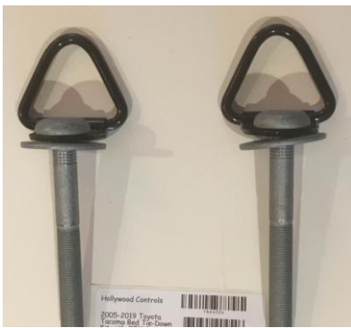
Figure 4 TA64007 KIT Using YOUR bolts