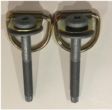
Figure 1 TA64006 KIT Using YOUR bolts